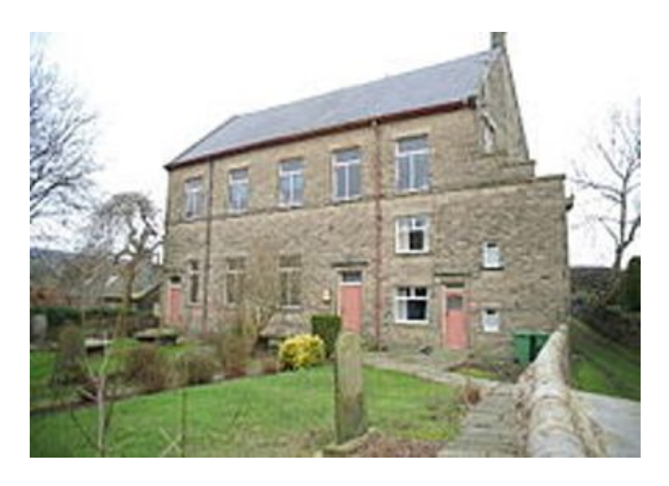
The new 1933 chapel and caretakers cottage shown circa 2009.

After the closure of the chapel it was sold into private ownership. The graveyards have been maintained, and memorial stones that were originally laid flat have been raised in order to protect the inscriptions for the future. Flowering blossom trees have been planted. The upper floor chapel area remains as it was formed in 1933. At the time of going to print it is understood that the lower school room area may be converted to a Chapel of Rest, therefore the religious connection to the building will be continued.